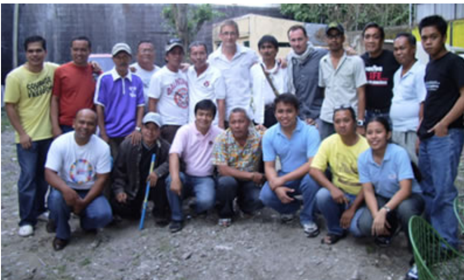
During the Christmas Party of the World Nickelstick Eskrima Club (December 2009)